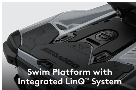
Swim Platform with Integrated LinQ™ System

Large front storage area that's easily accessible from a seated position. 1