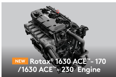
NEW Rotax® 1630 ACE™ - 170 /1630 ACE™ - 230 Engine

An industry-first manufacturer-installed, truly waterproof, Bluetooth ‡ audio system. 2