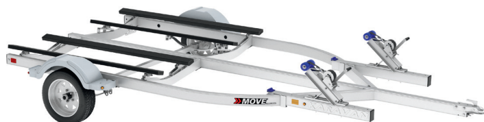
Aluminum MOVE II