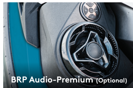
BRP Audio-Premium (Optional)

Exclusive quick-attach system on the largest swim platform in the industry that allows for easy installation of accessories.