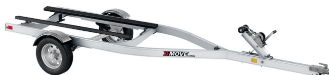
Aluminum MOVE I Extended 1250

©2019 Bombardier Recreational Products Inc., (BRP). All rights reserved.™, ® and the BRP logo are trademarks of Bombardier Recreational Products Inc. or its affiliates. Products are distributed in the USA by BRP US Inc. Because of our ongoing commitment to product quality and innovation, BRP reserves the right at anytime to discontinue or change specifications, price, design, features, models or equipment without incurring any obligation. Printed in Canada. †GTX is a trademark of Castrol Limited used under license. Because of our ongoing commitment to product quality and innovation, BRP reserves the right at anytime to discontinue or change specifications, price, design, features, models or equipment without incurring any obligation. ‡Bluetooth is a registered trademark owned by Bluetooth SIG, Inc. and any use such marks by BRP is under license. 1 Bin Organizers are not included. 2 GTX Limited 300 Shown. 3 Cell phone is not included.