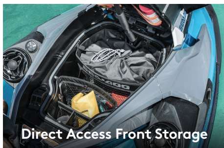
Direct Access Front Storage

Large front storage area that's easily accessible from a seated position. 1