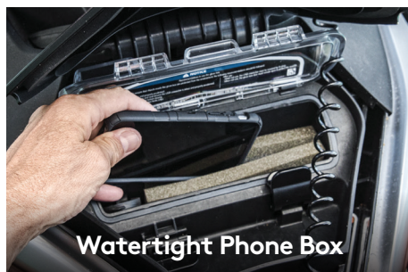
Watertight Phone Box

The Rotax® 1630 ACE - 230 offers instant acceleration by way of a powerful supercharger, while the new Rotax® 1630 ACE™ - 170 is the most powerful naturally aspirated Rotax engine ever on a Sea-Doo.